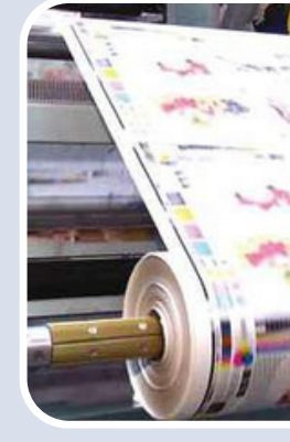
Visit Our Website www.fynotrims.com